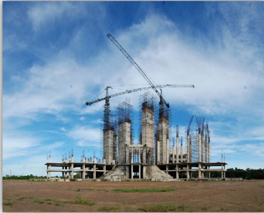
Phra Maha Jetiya Somdej – September 2010

To express gratitude for generous contributions, the temple is offering a variety of very sacred Buddha statues as “Thank You” gifts. Some were received in sacred ceremonies from eminent celestial beings. Others are very rare and extremely valuable antiques. Also, the names of those who donate at least 100,000 baht will be engraved in the Jetiya.